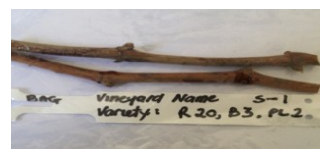
Fig 2: Single cane sample