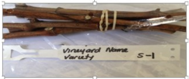
Fig 3: Composite cane sample